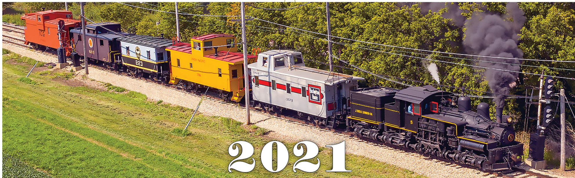
J. Neils Lumber Co. No. 5, a three-truck Shay logging locomotive built by Lima in 1929, heads east on the Museum's main line pulling a caboose train including Burlington Route 13572 (built in 1960), Union Pacific 3786 (1942), Belt Railway of Chicago 223 (1953), Chicago Great Western 601 (1946), and Illinois Central Gulf 199458 (1970).

VISIT WWW.IRM.ORG FOR INFORMATION AND UPDATES REGARDING OPEN DAYS, HOURS, FARES, AND SPECIAL EVENTS DURING 2021