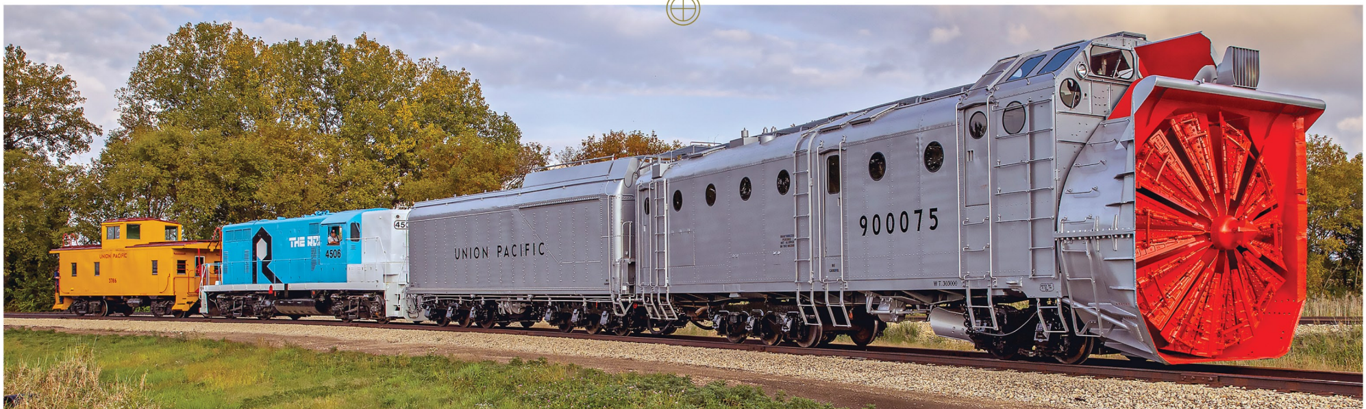
Freshly painted Union Pacific rotary snowplow & tender 900075 (built by Lima in 1949) is powered by Rock Island 4506, an Electro-Motive Division GP-7R locomotive (1952) pulling Union Pacific caboose 3786 (1942). The distinctive 1970's era paint scheme on The Rock EMD locomotive commemorates 100 years since the 1922 establishment of one of the nation's most successful locomotive builders.

VISIT WWW.IRM.ORG FOR INFORMATION AND UPDATES REGARDING OPEN DAYS, HOURS, FARES, AND SPECIAL EVENTS DURING 2022